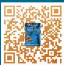
Cover photo illustration - JTSdesign

U.K £12.99 US $19.99 Living Zen Books Faction Thriller www.livingzenbooks.com